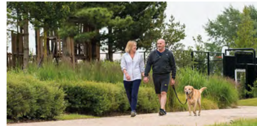
Dog Walking Routes