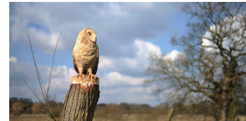
Art / Sculpture