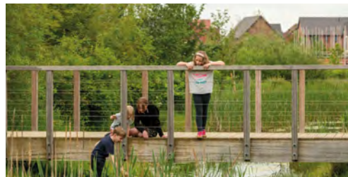
Access to water